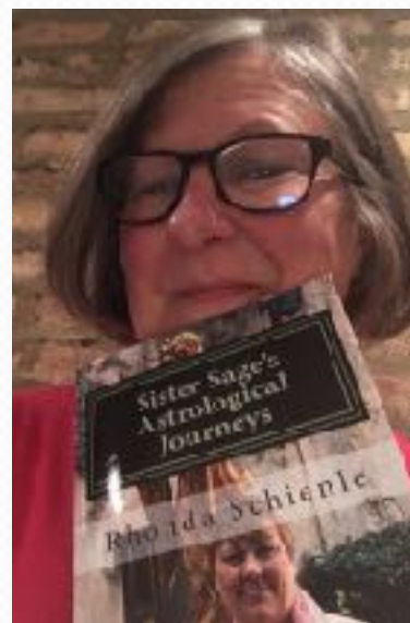
My book with local friends in Chicago above, and Valparaiso below.

The Dragon's Head in the sign of Leo and Dragon's Tail in Aquarius, which commenced on April 28th, 2017. We all will have some type of changes in the month of August and then February, 2018. What determines where the changes occur is the house on your astrological chart where Leo and Aquarius reside. For example, if you are born in May, your 4th house of home and family are changing and then your 10th house of career. As mentioned in the book, this combination of Leo and Aquarius will last for 18 months from March of 2017.