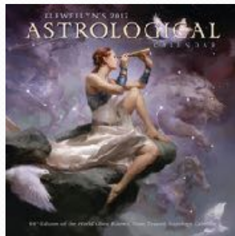
Llewellyn's Astrological Calendar